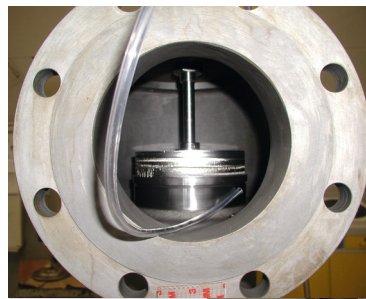
Location of test probe in EPA Method 21 test setup located directly at sealing surface.